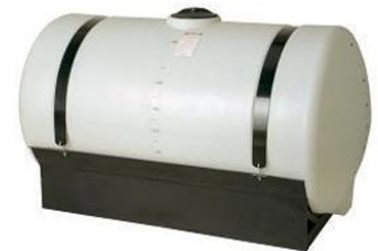
300 Gallon Tank