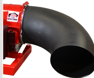
Aerospace Polymer Nozzle