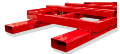
Fork Lift Pockets