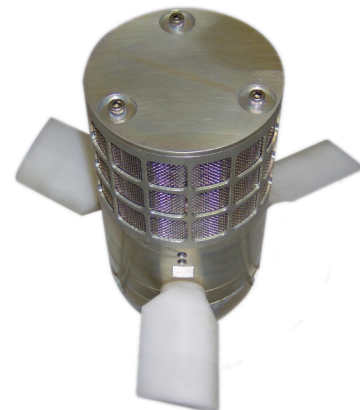
Atomizing Nozzle - No Clogs