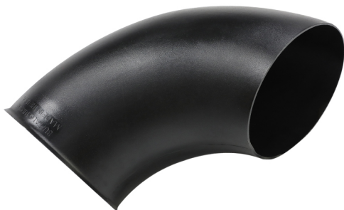
Aerospace Polymer Nozzle - Part# 2851