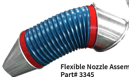
Flexible Nozzle Assembly - Part# 3345 Various lengths available. Ideal for rough terrain.

*Call sales and service to request custom nozzle configuration.