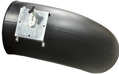
Aerospace polymer nozzle w\ butterfly valve assembly - Part# 5231