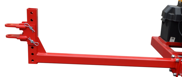
Quick & Easy Adjustable Hitch