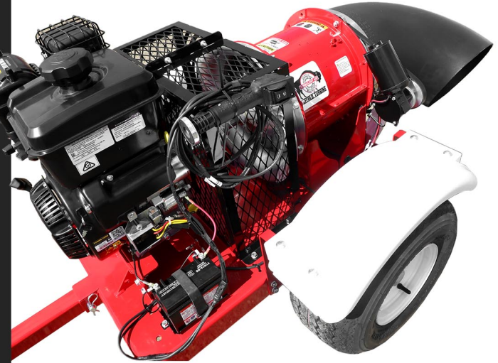
8000 (Carbureted Option)