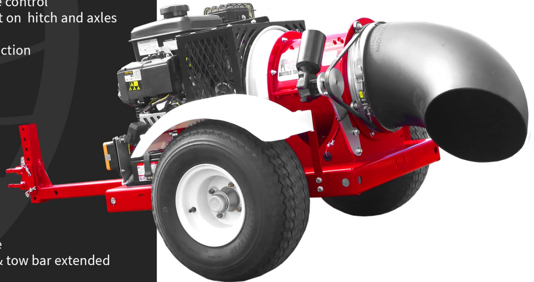
8000 (EFI Option)