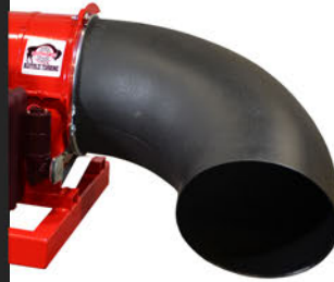
Aerospace Polymer Nozzle