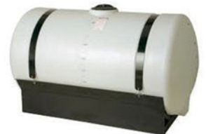
300 Gallon Tank